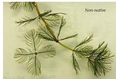
Eurasian watermilfoil ( Myriophyllum spicatum ).

Milfoil is known to form thick mats that crowd out and out-compete the lake's native flora, thereby reducing aquatic plant diversity and the quality of fishery habitat. It can also severely restrict recreational use of the lake by entangling swimmers and boat propellers, and by reducing the availability of open-water space. Large weed colonies are even shown to deplete dissolved oxygen levels and supply nutrients for algal growth during plant senescence and decay. Mechanical weed harvesting has been used to suppress the milfoil population and facilitate navigation and general lake use. Careful attention is given to collecting and removing all harvested plant material since weed fragments can re-root and grow into new plants.