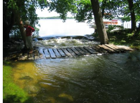
Water pours through the Lake Ripley outlet and floods the adjoining property following a 2008 high-water event.

Lake-level changes are important because they affect how we access the lake, what we can do around the lake, and the quality of water in the lake. Water levels typically respond to natural seasonal variations in precipitation, with higher levels in the spring and fall, and lower levels in the summer and winter. Water levels are also influenced by building and development within the watershed. Conversion of the landscape to water-impervious surfaces (i.e. roofs, roads, parking lots, etc.) increases stormwater runoff volumes and discharge rates, causing water levels to rise faster and higher during larger storm events. During drought conditions, wells and related groundwater pumping can cause lake levels to fall even faster and lower.