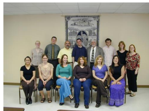
2007 photo showing U.W.-Madison and Lake District representatives who contributed to the development of CBSM programs for Lake Ripley.

To overcome these challenges, community-based social marketing (CBSM) programs were developed in partnership with the U.W.-Madison's Department of