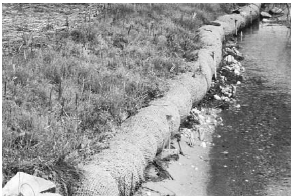
Buffer strips at work on Lake Ripley: Golfside Shoreline Association volunteers and the Lake District planted this eight-foot-wide buffer along 175 feet of their shoreline. They also installed coconut fiber logs to stabilize their shoreline.

The 175-foot-long buffer strip at the Golfside Association (see photo) cost residents only $90.